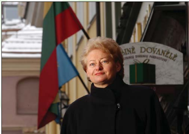
Dalia Grybauskaite during discussion.

Grybauskaite or the "Iron Lady," another of her nicknames ran as an independent candidate and won in a landslide on 17 May with over 68 percent of the vote. The results surprised no one.