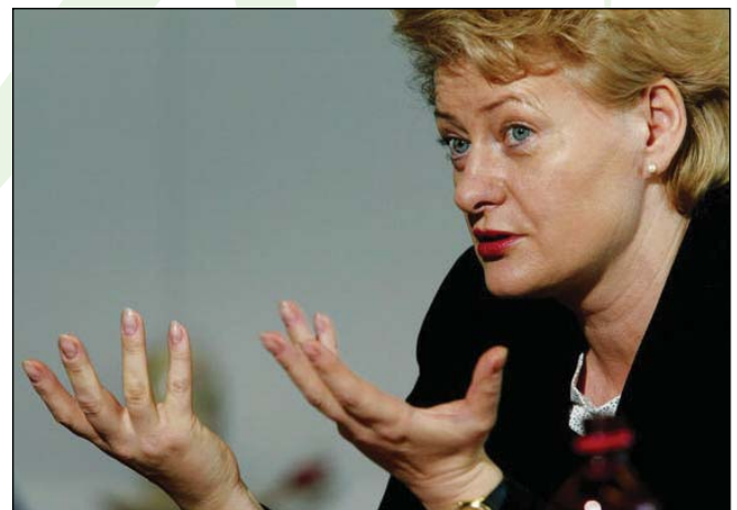
Dalia Grybauskaite during discussion.

In addition to her lengthy résumé, Lithuanians have been impressed with Grybauskaite's straight-talking toughness. Unlike other Lithuanian politicians, she gives direct answers to direct questions, and her rhetoric sometimes borders on the aggressive. She names and shames when she deems it necessary. (Provided by Transitions Online—Intelligent Eastern Europe )