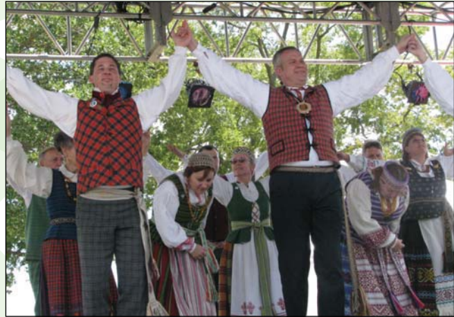
Ethnic Festival 2008.