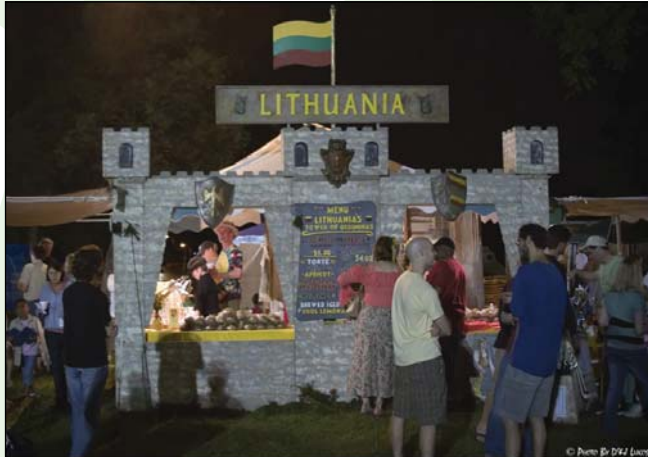
2008 Ethnic Festival.

August 21-23, of 2009 in Swope Park Friday.....6-10PM Saturday.....12-10PM Sunday.....12-6PM