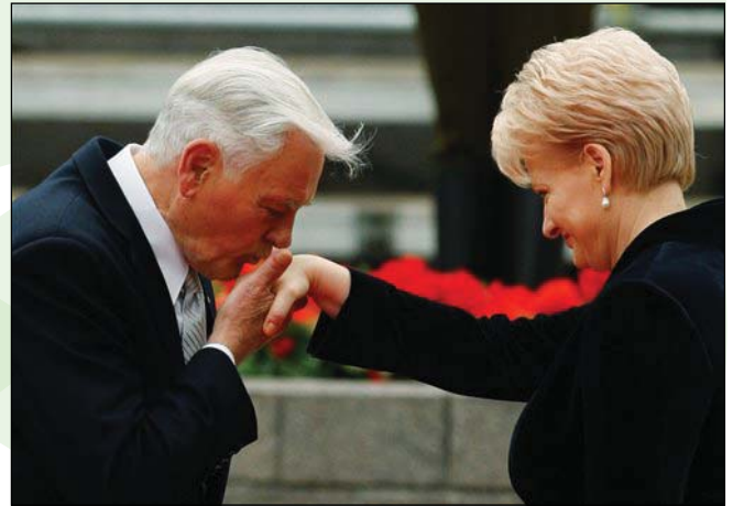
Lithuanian former President Valdas Adamkus kisses the hand of Lithuania's new President Dalia Grybauskaite, right, after an inauguration ceremony at the S. Daukanto Square, in front of the Presidential Palace in Vilnius, Lithuania Sunday July 12, 2009.

Until recently the European Union budget commissioner, Grybauskaite, has received high ratings in polls for the last few years and her popularity has only increased in recent months. When she announced that she was running for the presidency, the other potential candidates either withdrew at the start or remained in the contest only to garner public attention and visibility before the recent elections to the European Parliament. As a result, the presidential race featured tedious campaigns lacking intrigue, as the winner could easily be guessed beforehand.