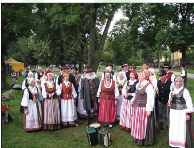
Saturday singers in the park.

The weekend preceding King Mindaugas Day was full of events: first the 1000-year Song Festival took place with thousands of participants from all over the world. The song festival is a traditional event in Lithuania where singers, dancers, choirs and musicians performed traditional songs and dances.