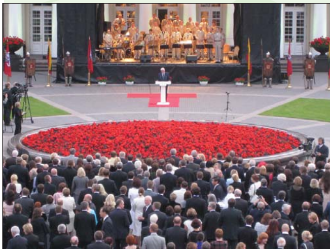
Speech by Valdas Adamkus at the Galla reception in the Presidential Palace Court Yard.

The Varpas is the official newsletter of the Lithuanians of America which is based in Kansas City. www.kclith.org