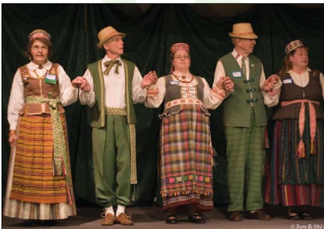
Independence Day 2008.